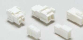
Rectangular Power Connectors(43)