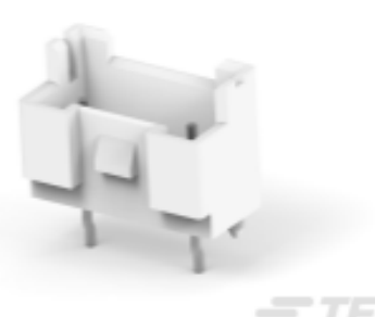
TE Part # 2316873-4 EP2.5 HDR ASSY 4P VERT, GW,NO PIN 2,3