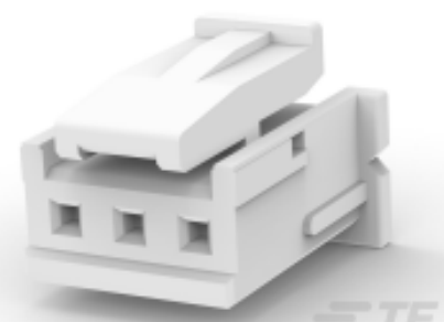
TE Part # 1969442-3 EP 2.5 TPA Housing, 3 Pos