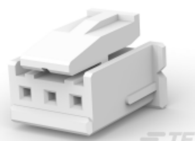
TE Part # 1744417-3 3 POS EP 2.5 HSG, GLOW WIRE