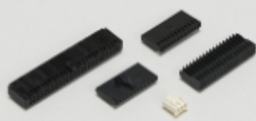
Wire-to-Board Connector Assemblies & Housings(311)