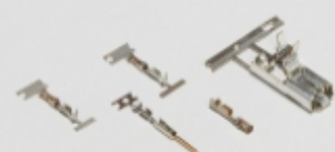
Wire-to-Board Connector Contacts(6)