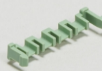
PCB Latches, Locks & Retainers(49)